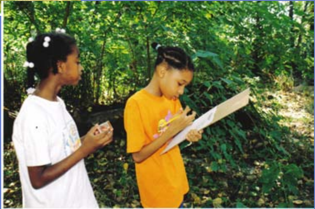
The girls taking data