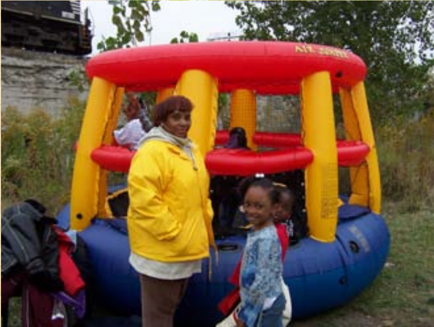
Taking turns going in the bounce house