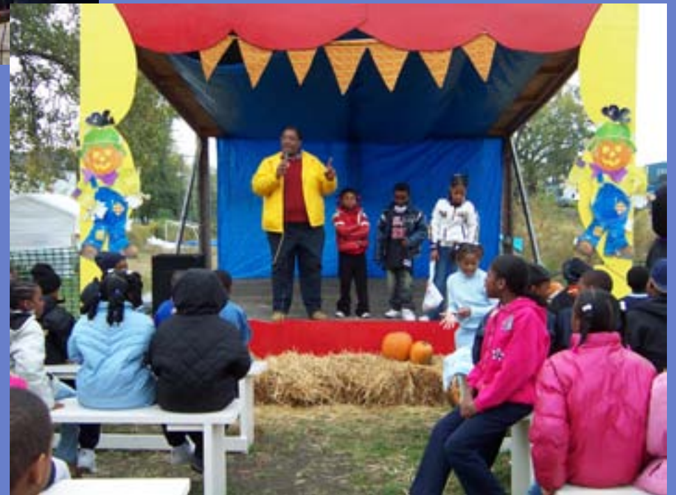
And going over the rules