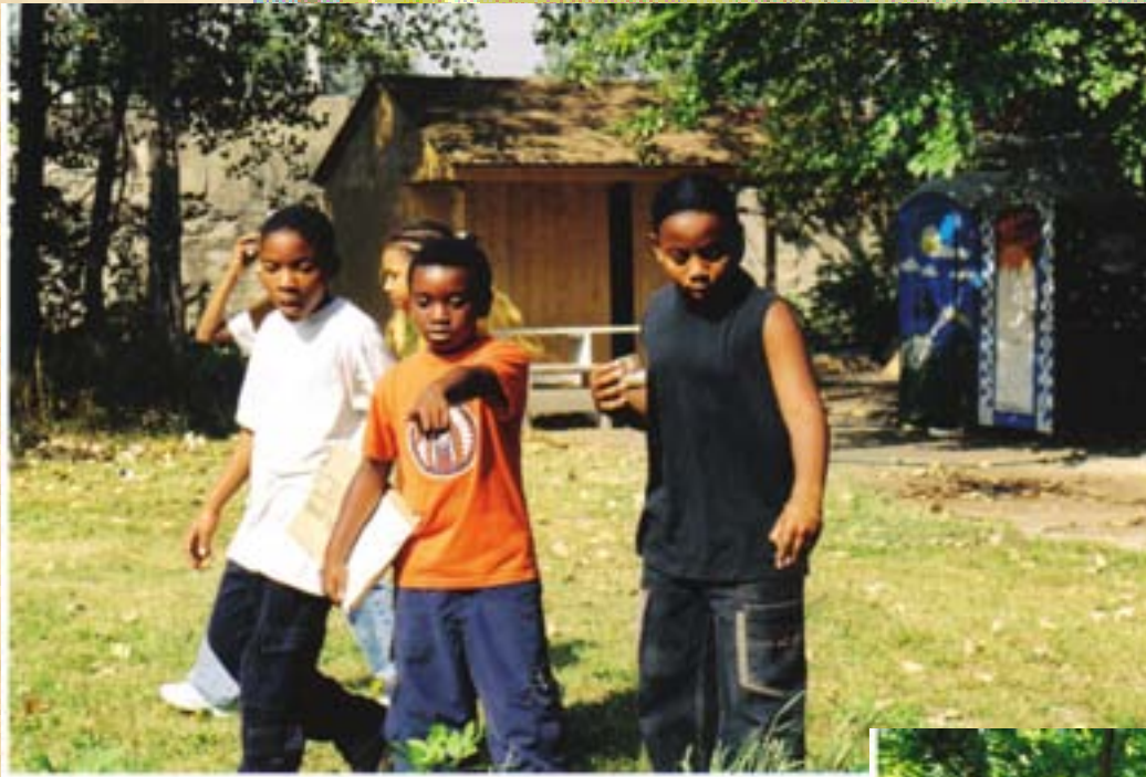
The boys finding something interesting in the prairie