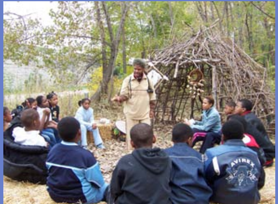
Native American Studies with DuSable